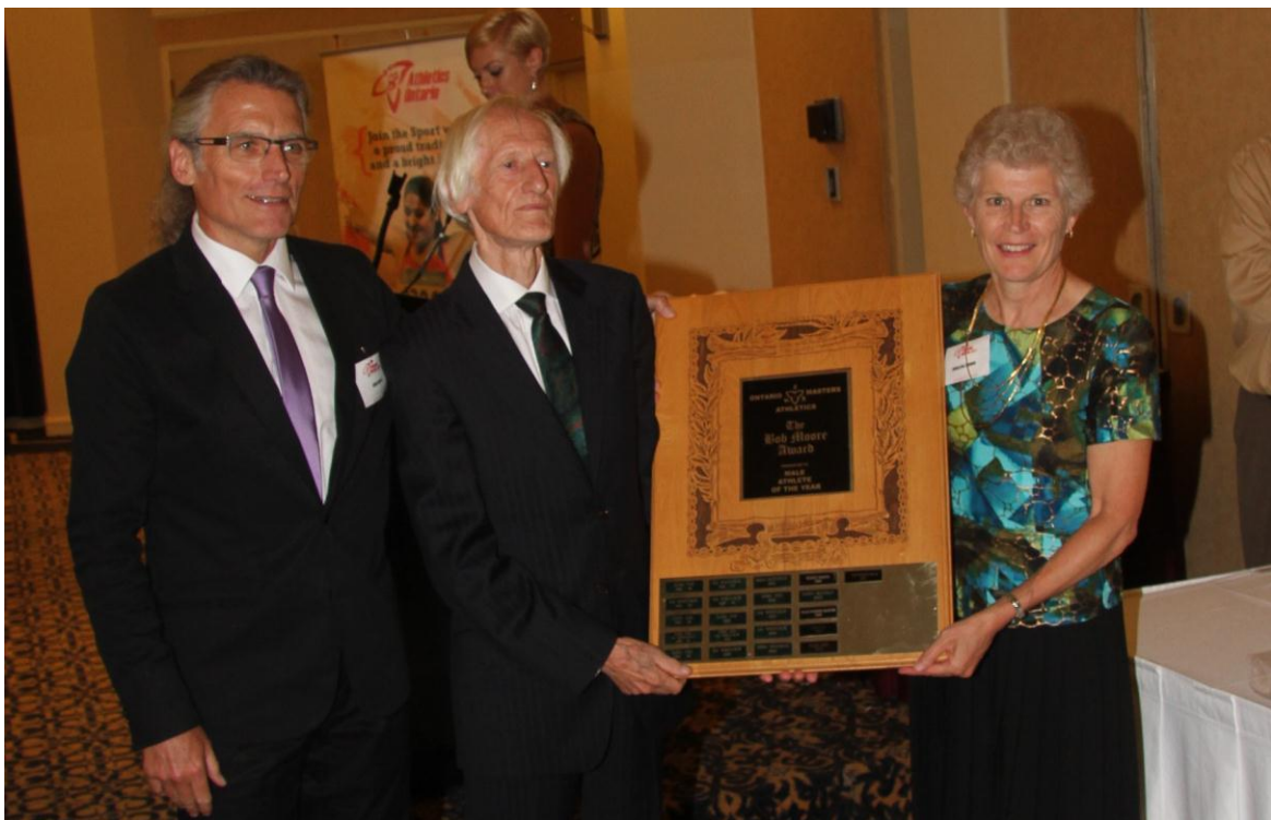
Ed Whitlock was awarded the Ontario Masters Male Athletes of the Year . Ed received the Bob Moore Award . The presentations were made at the annual Ontario Athletics Awards Banquet at the Don Valley Hotel on Saturday, September 24th.